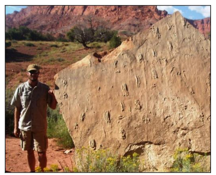
Figure 2: Swim tracks comprising an offset trackway in Capitol Reef National Park, Utah.

produced under are swim tracks subaqueous conditions by buoyant or partially buoyant animals (Thomson & Lovelace, in review) (Figure 2). The purpose of this research is to 1) document and describe these swim tracks and test the hypothesis that they are formed by multiple different types of reptiles "swimming" in shallow water and 2) place these trackways into the context of known Triassic reptiles and their possible paleoenvironmental affinities.