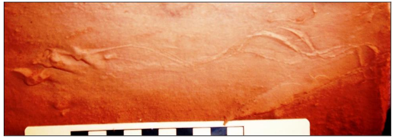
Figure 3: Long, sinuous swim track leading up to a Rotodactylus footprint.

Although terrestrial reptile tracks have been thoroughly described and are well known from the Moenkopi Formation (Klein & Lucas, 2010), swim tracks from this rock unit have not been given similar consideration. They have been previously misidentified as tool marks (Boyd, 1975) and even when recognized as tetrapod traces the identity of the trackmaker has remained somewhat controversial, with most workers ascribing them to either amphibians or reptiles (Kirby, 1987; Peabody, 1956). However, certain characteristics of the swim tracks such as scale striations and nail/claw marks indicate reptilian producers. In some instances these swim tracks have been found in association with reptilian ichnotaxa such as Chirotherium and Synaptichnium (medium- to large-sized rauisuchian archosauriforms), Rotodactylus (small- to medium-sized lepidosauromorph) ( Figure 3 ), and Rhynchosauroides (small lepidosauromorph) (Thomson & Lovelace, in review).