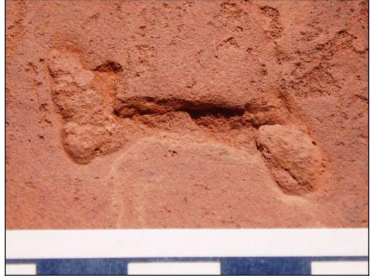
Figure 5: Diplocraterion parallelum from a swim track site in Glen Canyon National Recreation Area, Utah

The high-fidelity with which the swim tracks are preserved allows for the identification of track characteristics which indicate the swim direction of the trackmaker. Preliminary