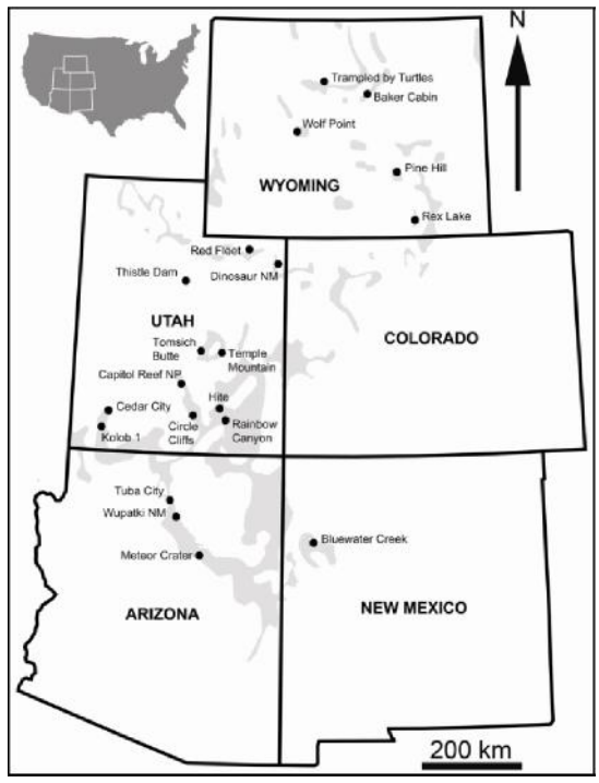
Figure 1: Map of western North America showing the general outcrop distribution of the Lower Triassic Moenkopi and Red Peak formations and currently known swim track localities.

The Permian/Triassic mass extinction was the largest in earth history and resulted in the restructuring of the marine and terrestrial realms. The nature of this biotic recovery is critical to our understanding of how ecosystems recover from and are restructured after such events. Recovery in the marine realm is considerably better understood than that in the terrestrial realm largely because of the nature of the fossil record. The Lower Triassic Red Peak and Moenkopi formations are the oldest stratigraphic record of terrestrial rocks from the post-extinction time interval cropping out throughout Wyoming and the Colorado Plateau (UT, NV, AZ, and NM) (Figure 1). These units thus form a well-exposed and widespread natural laboratory for investigating the aftermath of this extinction in the terrestrial realm. They also provide the first window in time for studying the Early Triassic radiation of reptiles and their behaviors.